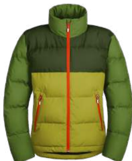
Mega Puff Jacket Starting at $299 MSRP