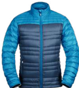
Standard Down Jacket Starting at $249 MSRP