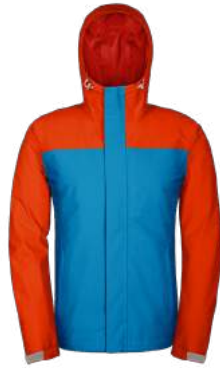
All Weather Jacket Starting at $179 MSRP