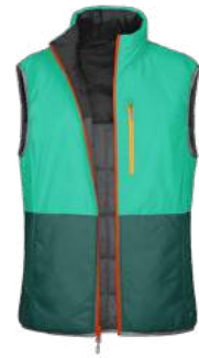
Reversible Vest Starting at $145 MSRP