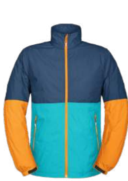
Windbreaker Starting at $129 MSRP