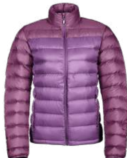
Puffy Down Jacket Starting at $299 MSRP