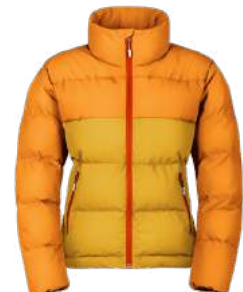
Mega Puff Cropped Jacket Starting at $289 MSRP