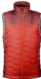
Synthetic Vest Starting at $179 MSRP