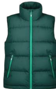
Mega Puff Vest Starting at $219 MSRP