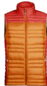
Down Vest Starting at $199 MSRP