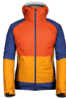
Rain Jacket Starting at $199 MSRP