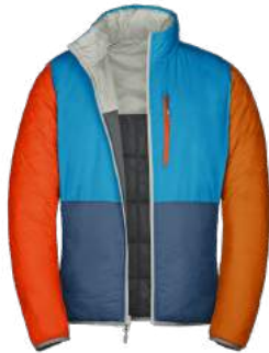
Reversible Jacket Starting at $165 MSRP