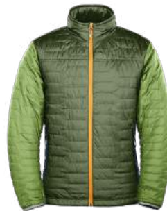
Synthetic Jacket Starting at $199 MSRP