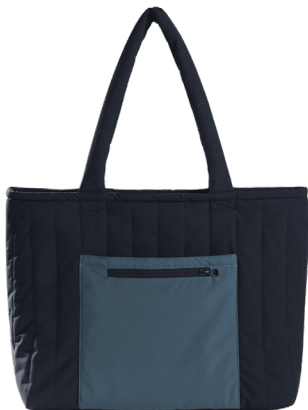
Puffy Tote Starting at $79 MSRP *10 unit MOQ required