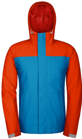
All Weather Jacket Starting at $179 MSRP