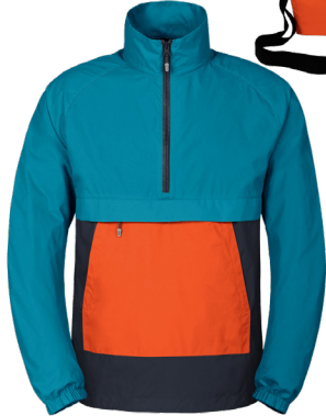
Windbreaker Anorak Starting at $119 MSRP