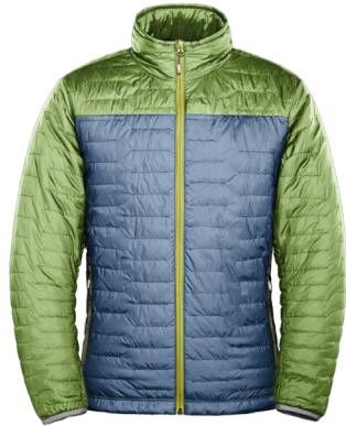
Synthetic Jacket Starting at $199 MSRP