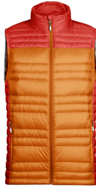
Down Vest Starting at $199 MSRP