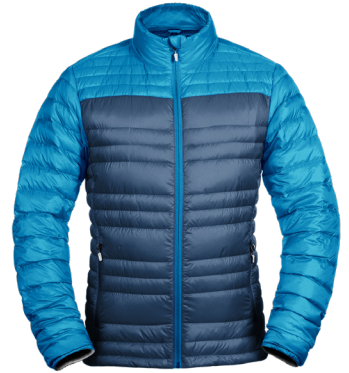
Standard Down Jacket Starting at $249 MSRP