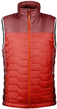
Synthetic Vest Starting at $179 MSRP