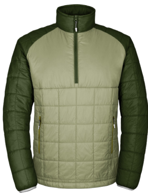
Insulated Pullover Starting at $159 MSRP