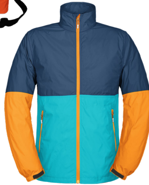
Windbreaker Starting at $129 MSRP