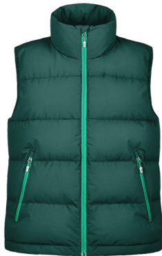
Mega Puff Vest Starting at $219 MSRP