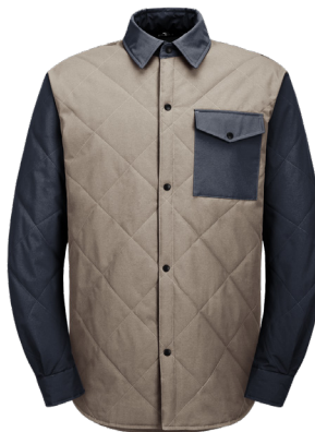
Insulated Shirt Jacket Starting at $169 MSRP