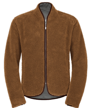
Reversible Sherpa Jacket Starting at $169 MSRP