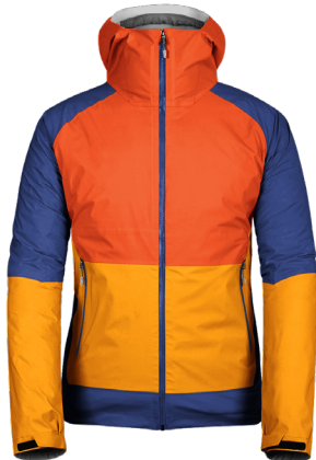
Rain Jacket Starting at $199 MSRP