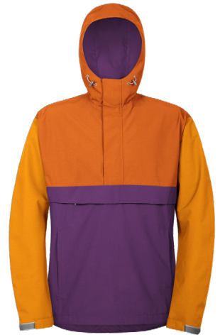
All Weather Anorak Starting at $175 MSRP