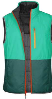
Reversible Vest Starting at $145 MSRP