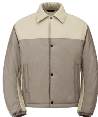
Coaches Jacket Starting at $169 MSRP