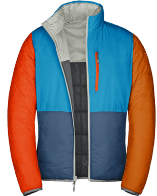
Reversible Jacket Starting at $165 MSRP