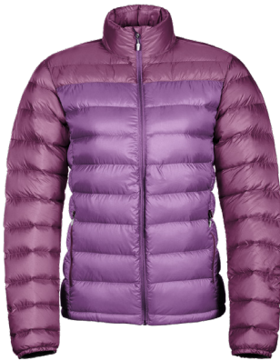
Puffy Down Jacket Starting at $299 MSRP