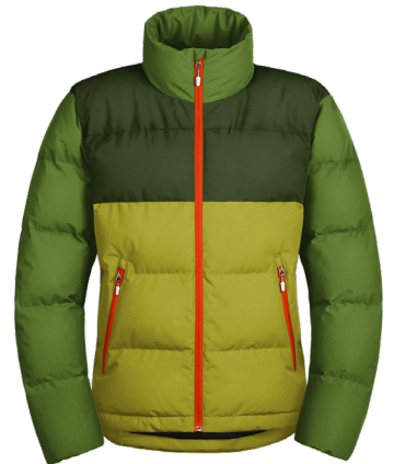
Mega Puff Jacket Starting at $299 MSRP