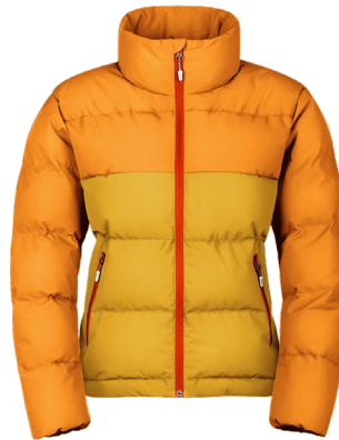
Mega Puff Cropped Jacket Starting at $289 MSRP