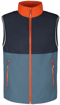
Wind Vest Starting at $99 MSRP