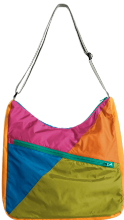
Crossbody Bag Starting at $69 MSRP *10 unit MOQ required