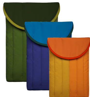
Laptop Sleeve (3 Sizes) Starting at $49 MSRP *25 unit MOQ required